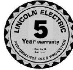
POWER WAVE 300C ADVANCED